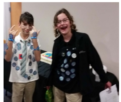
Fun was had by all!