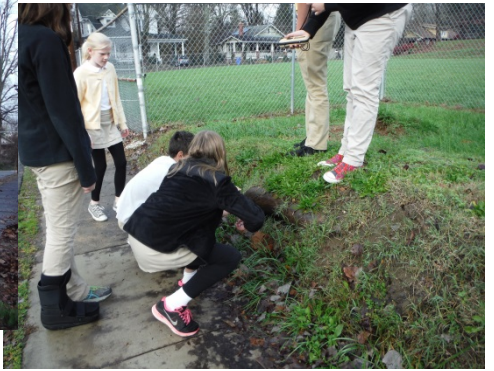
Digging for the cache.