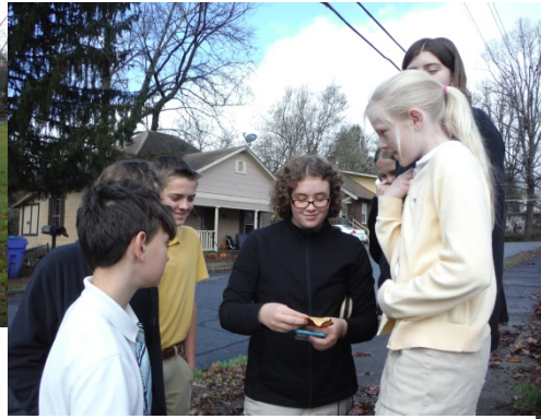
Students man the GPS