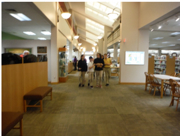
Following the map through the library