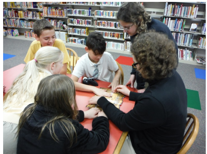
Assembling the treasure map pieces.