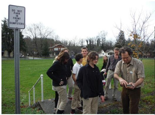
The hunt is on!