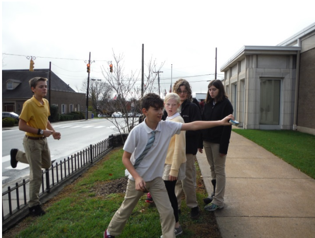
Found the last piece of the puzzle