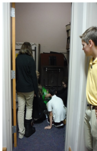
Treasure at last